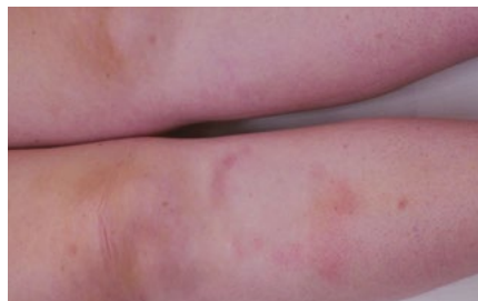
Figure 1. Photograph of the patient's right anterior shin

As the working diagnosis is thought to be confined to the subcutaneous layer, biopsies should be performed to include a substantial amount of fat. 1,2